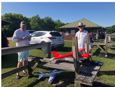
Preparing to fly in Vero Beach